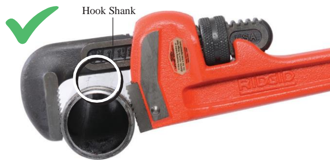
Figure 3 – Maintain Gap Between Hook Shank and Work Piece

Make sure the work piece is stable and well supported to prevent tipping and falling during use. When using a pipe wrench of any size, a gap must be maintained between the shank of the hook jaw and the work piece. (Figure 3) This permits the two gripping points (heel jaw teeth and hook jaw teeth) to produce the gripping action of the wrench. Allowing the shank of the hook jaw to contact the work piece greatly reduces the gripping action and can cause slippage. It may also result in the failure of the hook jaw. (Figure 4)