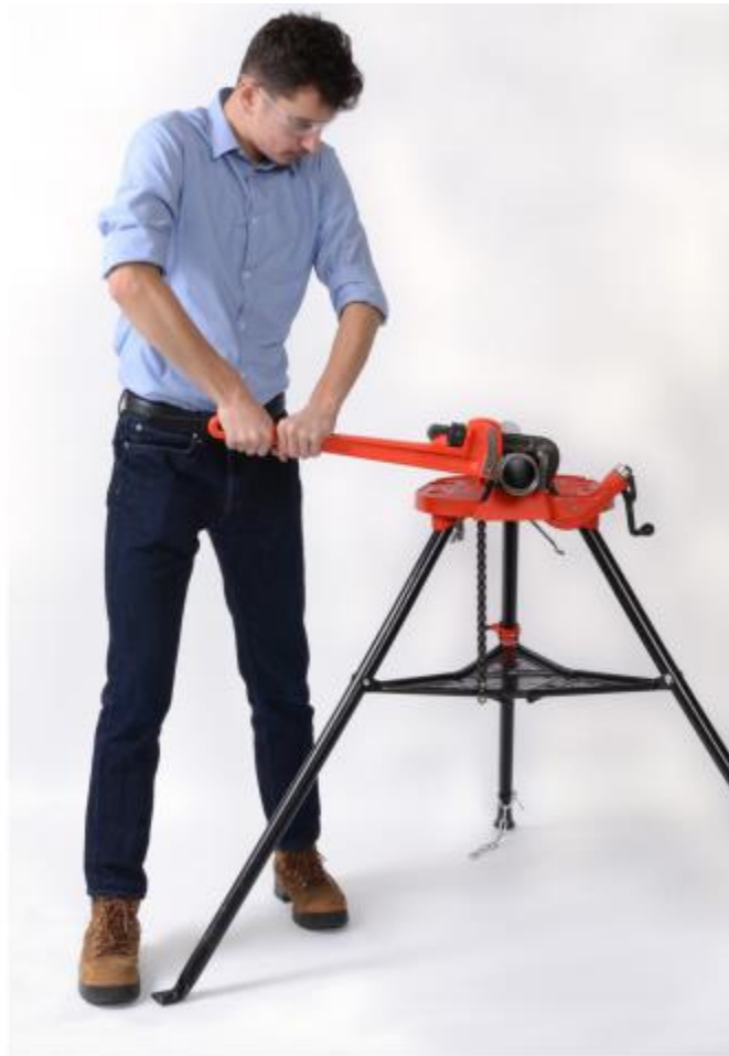
Figure 7 – A Proper Operating Position

If the person receiving this handout will not be the user of the equipment, forward these instructions to the operator. If there is any doubt as to the operation or safety of the equipment, DO NOT USE!!! CALL A TOOL SHED IMMEDIATELY!!! FAILURE TO FOLLOW THESE INSTRUCTIONS COULD RESULT IN INJURY OR DEATH