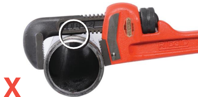
Figure 4 – Wrench Too Small for Work Piece, Hook Shank Touching Work Piece.

Adjust the hook position by rotating the nut as needed. Wrench should be square to the pipe. Do not use with the wrench at an angle to the pipe.